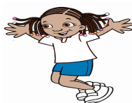
Jumping beans Jump on the spot