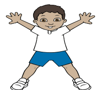
Frozen beans Freeze