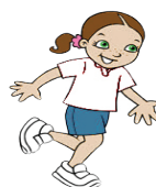
Runner beans Run on the spot